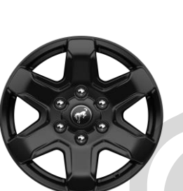
17" Black High Gloss-Painted Aluminum (64H) (Optional on Black Diamond™)